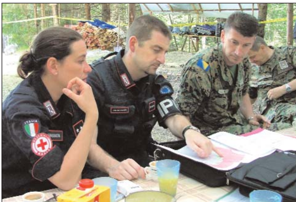
EUFOR and AFBIH personnel during training

On 22nd May EUFOR personnel commenced training first aid and emergency procedures for the first time to AFBIH personnel in Bugojno. This move represents an advance in the training provided by EUFOR and demonstrates EUFOR's commitment to providing assis-