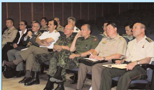
Military Attaches during presentation in HQ EUFOR

HQ EUFOR hosted a visit of the multinational Corps of the Military Attaches on 4th June. The visitors comprised of representatives from ten countries who are all employed in positions within BIH, and are contributing nations to the EUFOR mission. The only exceptions are China and Russia, who expressed a keen interest in the effectiveness of the EUFOR mission in BIH.