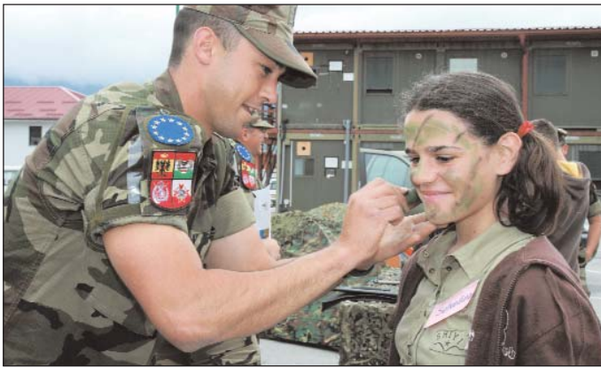
Spanish soldier applying unusual "make-up" on a girl