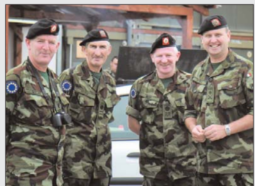
EUFOR troops did their best to organize a day of fun for the orphaned children