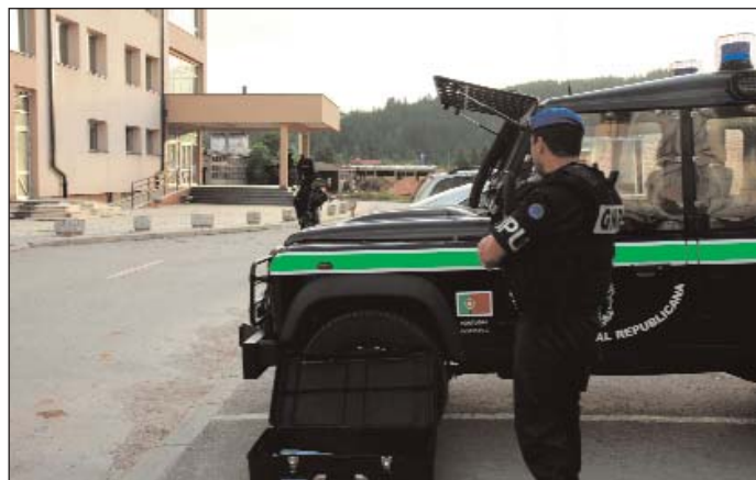
IPU with RS MuP

The local police, RS MuP, were informed of the operation and provided support. We would wish to emphasise that the initiation of this operation and significant elements of the security are being performed by the RS MuP. We commend them for their professionalism, courage and commitment.