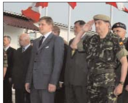
On the 2nd June, the Prime Minister of Slovakia Robert Fico, with the minister of defence, Varoslav Basca, visited COM EUFOR, and they attended the Slovak Medal Parade.