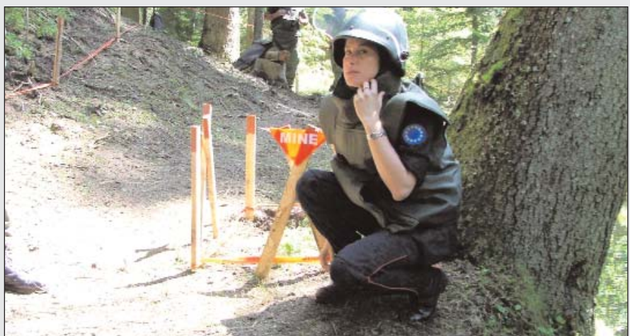
EUFOR specialists provided advanced training to AFBIH

“Medical expertise is a necessary element to any Army and I have been very pleased to provide EUFOR personnel to assist in this training for AFBIH. This also marks an increase in the areas of cooperation, as we continue to support their positive work and towards BIH assuming full responsibility for the process of achieving NATO and European integration”.