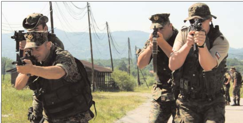
Combined troops of MNBN and AFBIH during exercise

- Rifle shooting exercise in Pasa Bunar fire range with the active participation of AFBIH Platoon using the night vision sights and weaponry of the B Company. Cross training was carried out using both AFBIH M-16 and