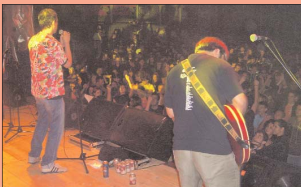
Band playing during the festival for a large crowd

The three day Srebrenica Music Festival is now in its 6th year and on this occasion EUFOR has been pleased to be able to provide support to this worthwhile event. The festival had a range of activities, which culminated in a concert involv-