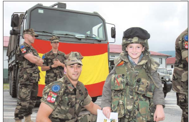
Kids were fascinated by the military equipment on display