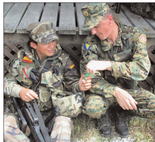
Sharing between EUFOR and AFBIH

A second exercise was conducted by C Coy of MNBN from 26th to 30th of May, also in the Training area of Eagle Base/Comanche Base (Tuzla). This cooperation has been the last one scheduled by MNBN among companies of the Battalion and AFBIH units. Polish Company carried