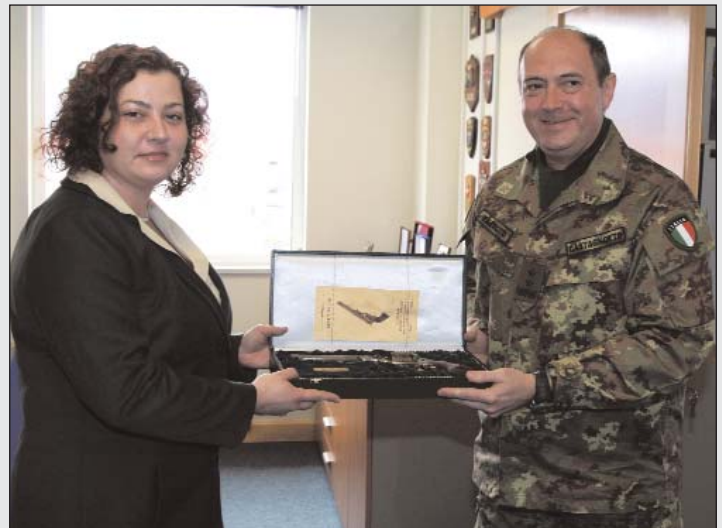
Senior State Secretary of MoD