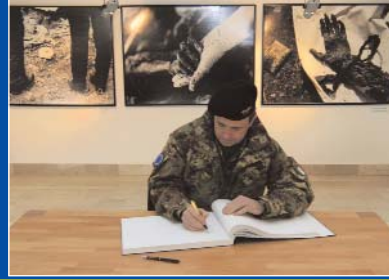
COM Pays His Respects in Srebrenica