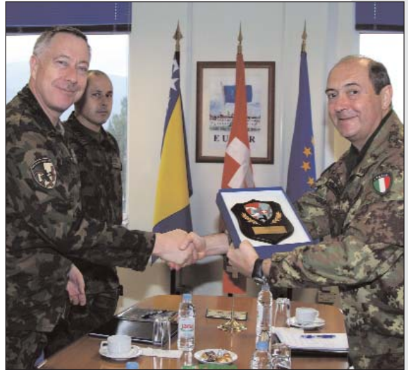
Major General Andre' Blattmann, Chief of the Armed Forces, Switzerland