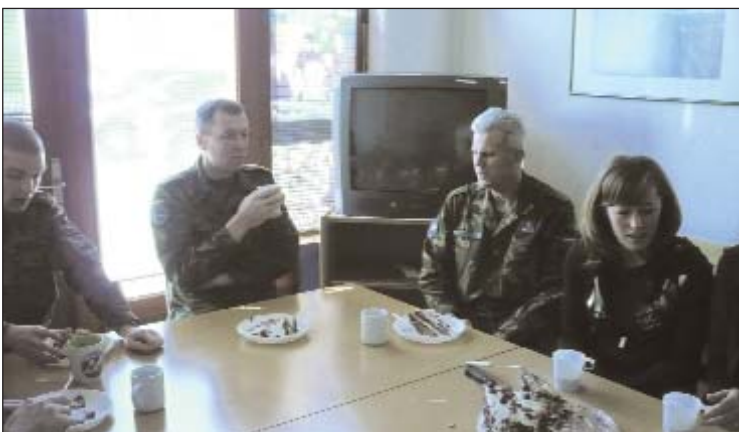
COS EUFOR engaged in discussion with LOT Livno

According to the personnel the General showed to have a clear view about the future of this country and provided them with good and stimulating ideas to complete their mission successfully. It was also highly appreciated that he showed to be interested in the personnel as well.