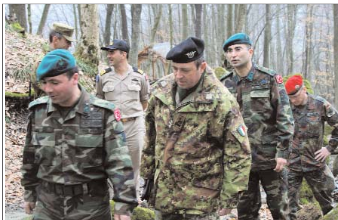
COM EUFOR was warmly welcomed by LOT Zavidovici