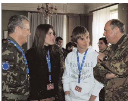
COM and DCOM EUFOR during reception