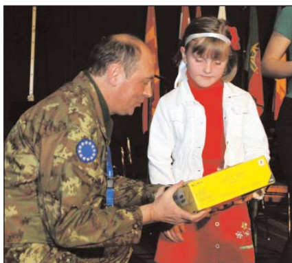
COM EUFOR handed over the prizes