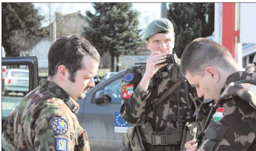
LOT members have been extracted by MNBN during the exercise