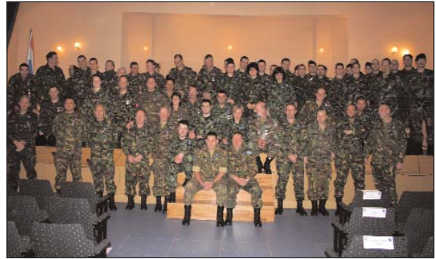
86 members received medals for their participation in the operation ALTHEA

The event was also attended by the Ambassador of Switzerland to BIH, the Commander of the Royal Netherlands Army, the Chief of Swiss Military Intelligence, the