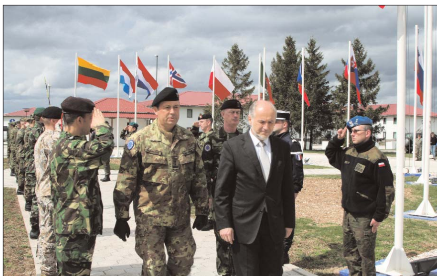
COM EUFOR MG Castagnotto and HR/EUSR Valentin Inzko during parade

The HR/EUSR stated, "The EU is resolute in its commitment to a prosperous and stable BiH inside the EU. 27 EU Foreign Ministers again this weekend