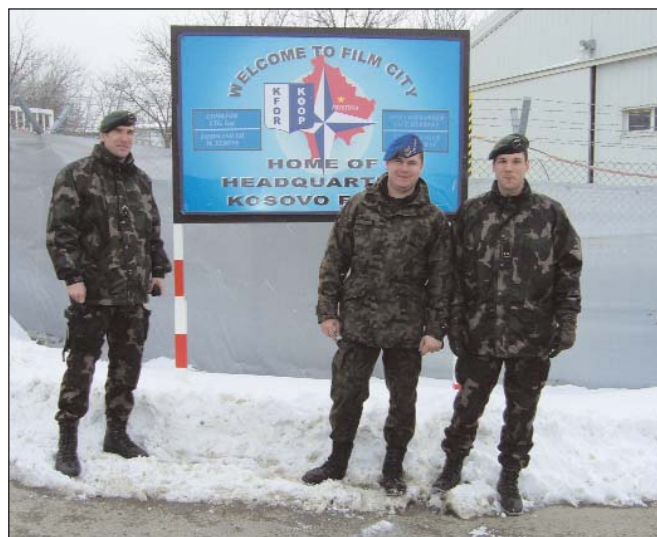
EUFOR members in front of the KFOR HQ