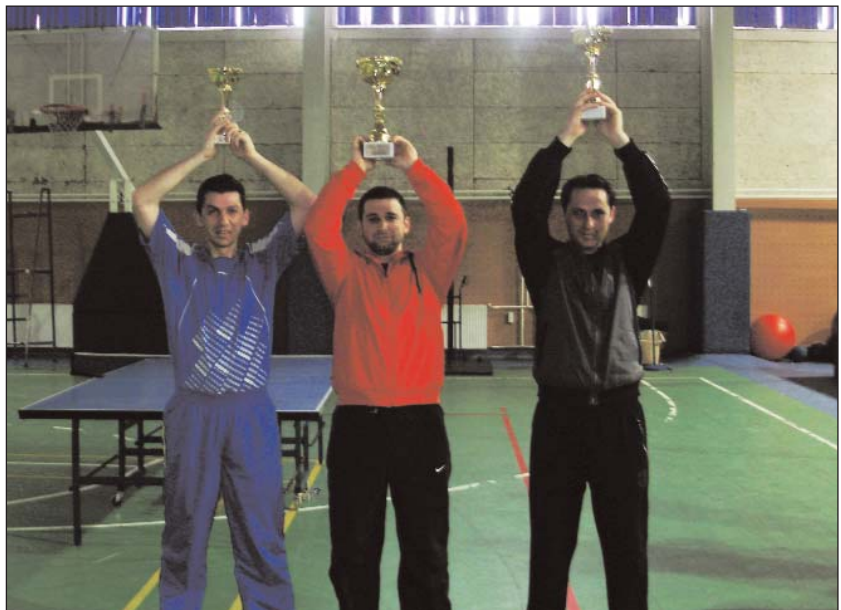
Trophies raised high after the tournament ended