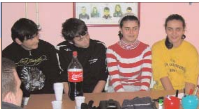
Members of LOT Bijeljina with volleyball players