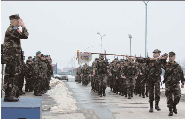
Spanish Members of EUFOR being inspected