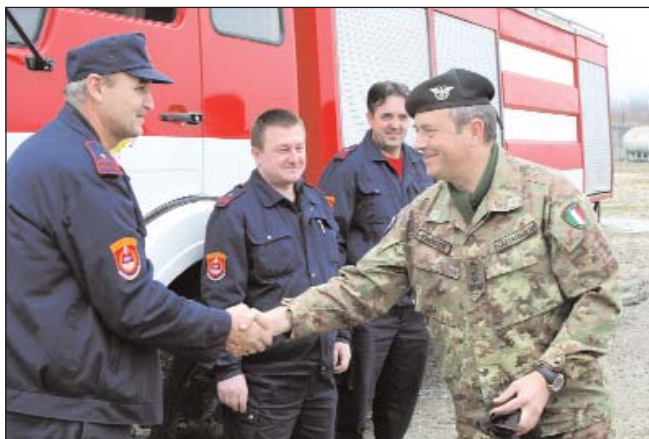
COM EUFOR with members of Fire Brigade