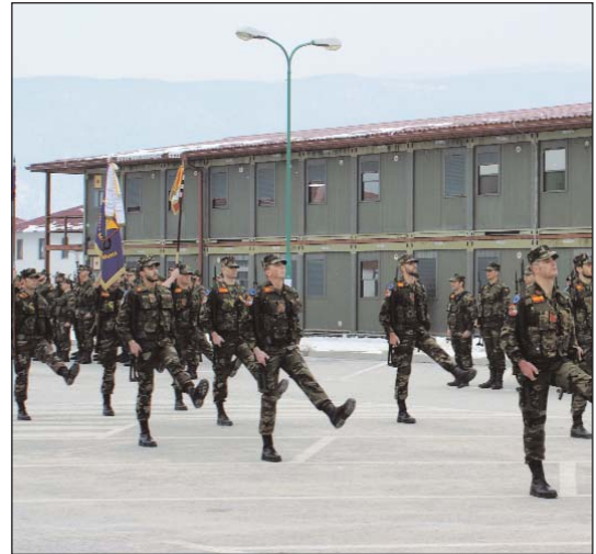
Parade of Spanish troops in Camp Butmir