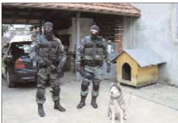
Members of Republica Srpska Police securing the house

These operations are legally based upon the mandate of the ICTY, EUFOR and NATO under the relevant UN Security Council Resolutions and the General Framework Agreement of Peace in Bosnia and Herzegovina.