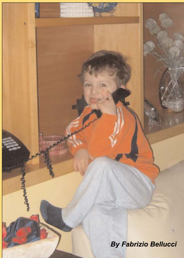
By Fabrizio Bellucci