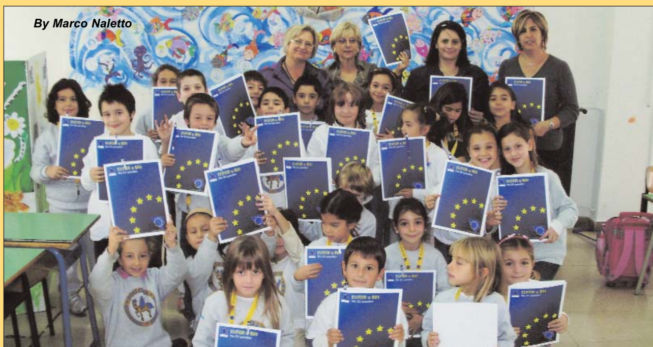
By Marco Naletto