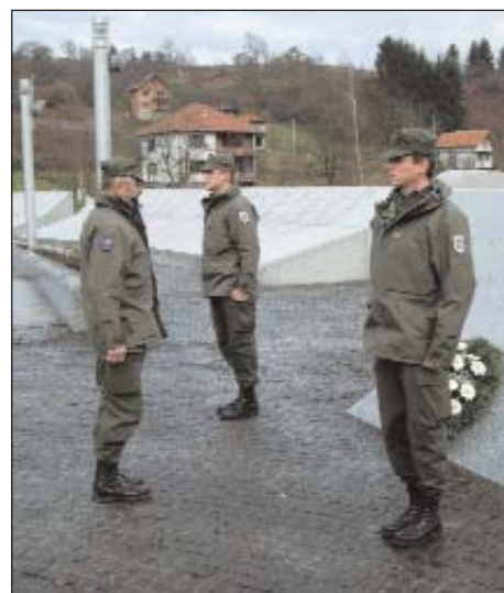
Short ceremony was held to lay the wreath

Officials of the memorial centre thanked LOT Bratunac