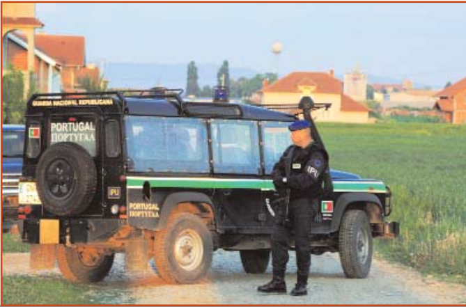
◆ Members of the Portuguese GNR secured the location