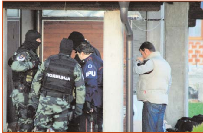
◆ Police of Republika Srpska gave their full support