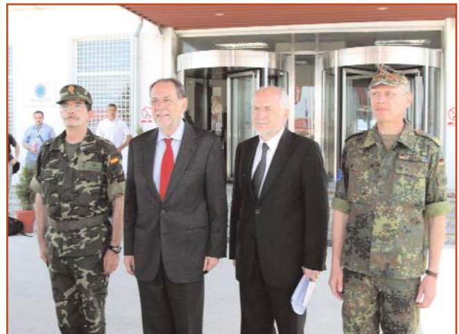
◆ DCOM EUFOR, Javier Solana, Valentin Inzko and COS EUFOR

DCOM EUFOR, Javier Solana, Valentin Inzko and COS EUFOR