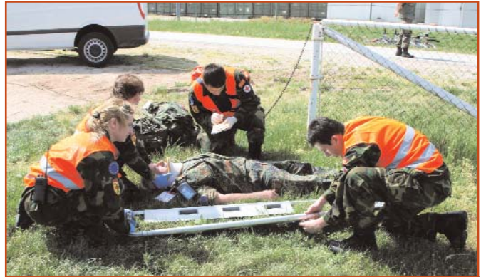
◆ First aid and triage

Medical exercise was held in Camp Butmir on 14th May 2009. Goal of the exercise was to demonstrate to the observers from Armed Forces of BiH (AFBIH) medical reaction, giving of first aid and evacuation of the injured persons, both via land and via air by using medical helicopter.