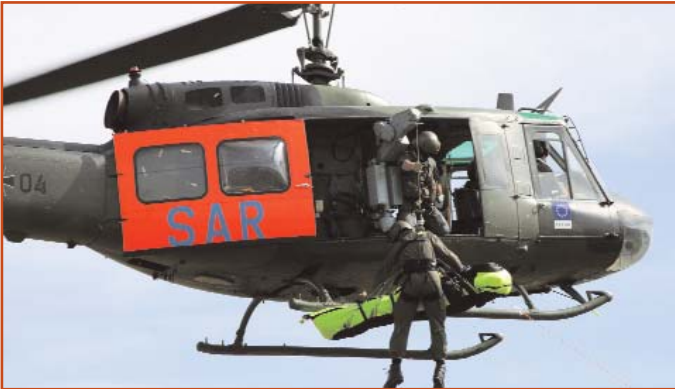
◆ Injured person was evacuated with MEDEVAC helicopter