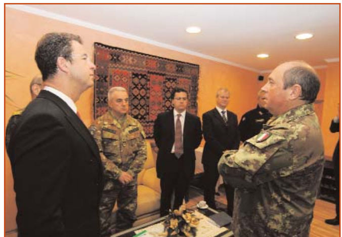
◆ Mr Serge Brammertz during his meeting with COM EUFOR