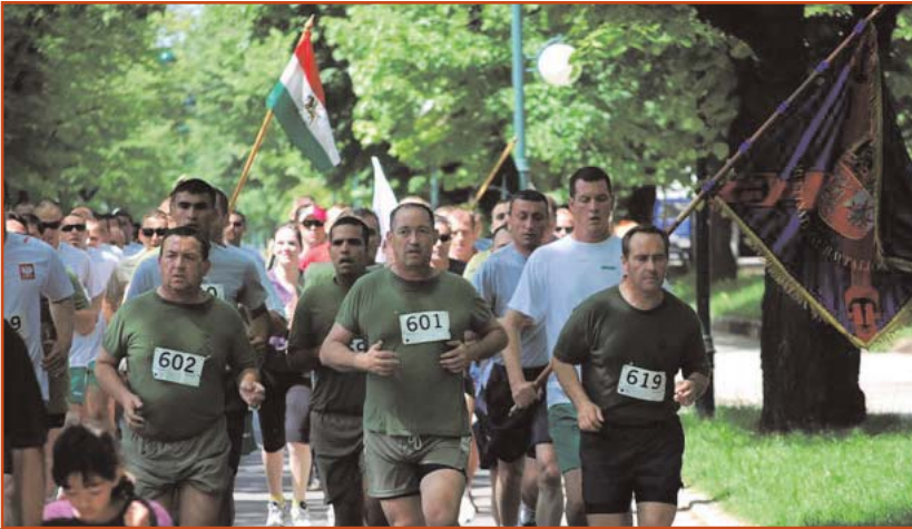
◆ Members of EUFOR and particularly MNBN participated en masse

The Delegation of the European Commission to BiH and the Directorate for European Integrations (DEI), in cooperation with the Association "Marathon Sarajevo" marked Europe Day, 9th May, with a symbolic race called "Trkom u Evropu" (Race to Europe). The race began at 11 o'clock on the Square of Bosnia and Herzegovina. Over 400 runners of all ages and categories entered the race. Many of the participants came from EUFOR.