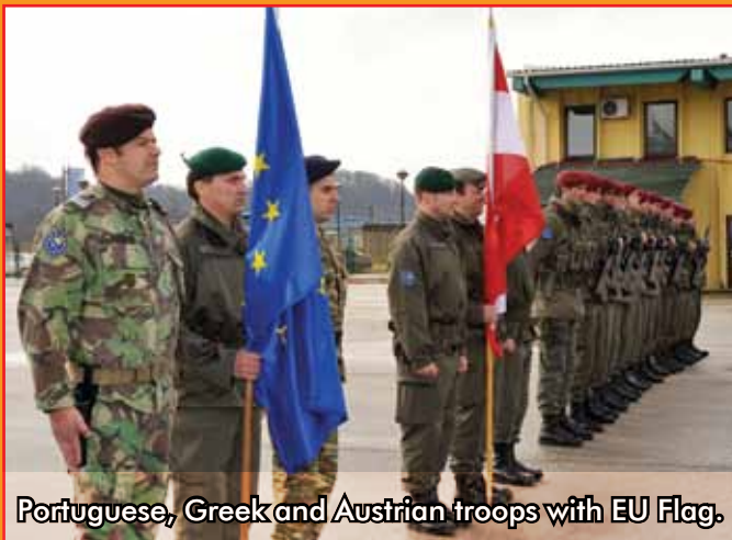
Portuguese, Greek and Austrian troops with EU Flag.

the LOT houses can be found on the EUFOR website here.