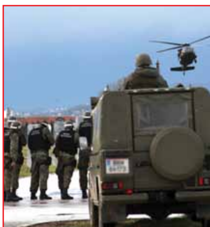
Members of MNEN and AFBiH during the demonstration held for the visiting members of PSC.

Austrians celebrate their National Day 10&11