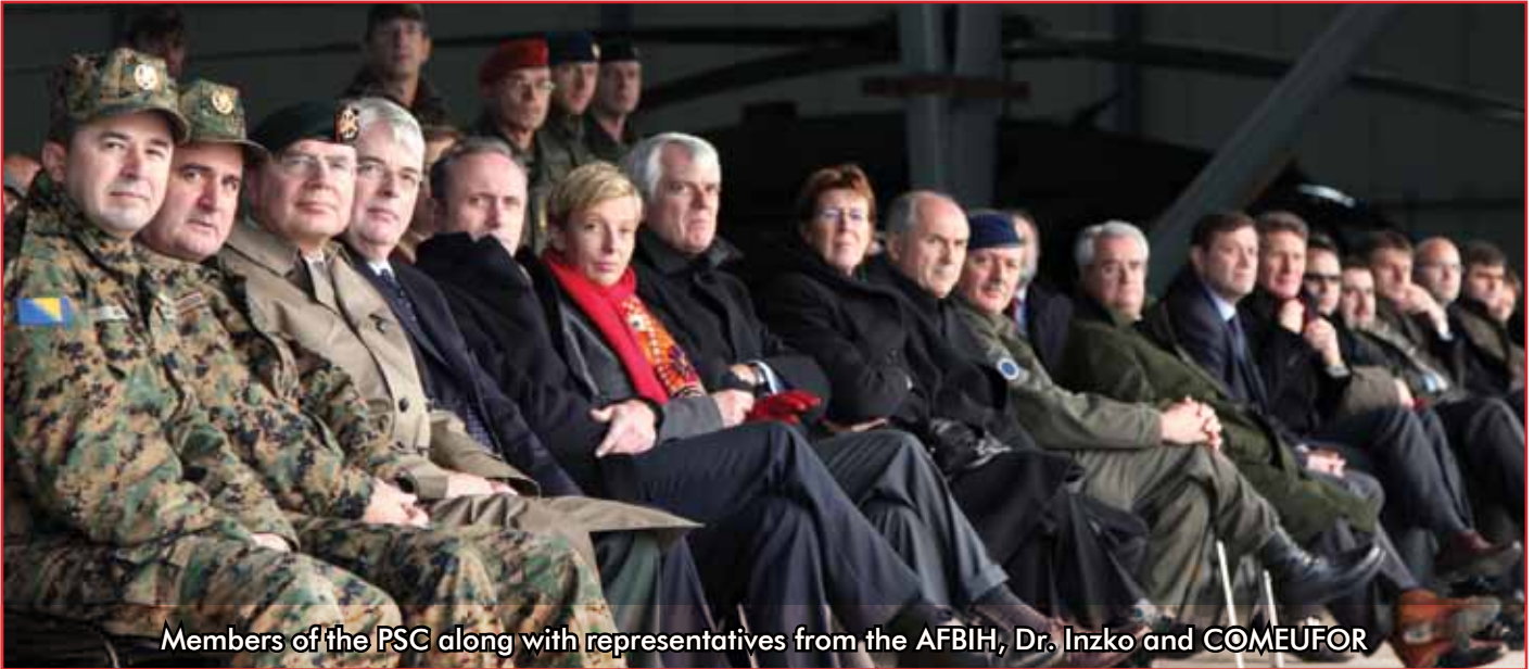
Members of the PSC along with representatives from the AFBiH, Dr. Inzko and COMEUFOR