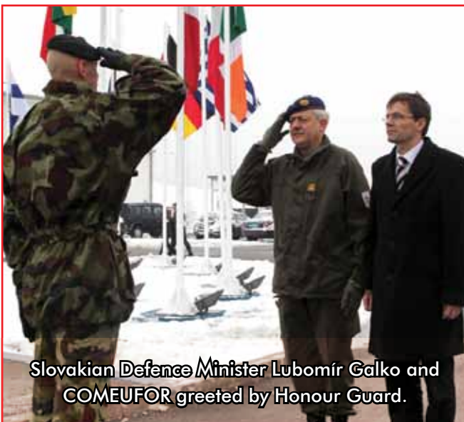
Slovakian Defence Minister Lubomír Galko and COMEUFOR greeted by Honour Guard.