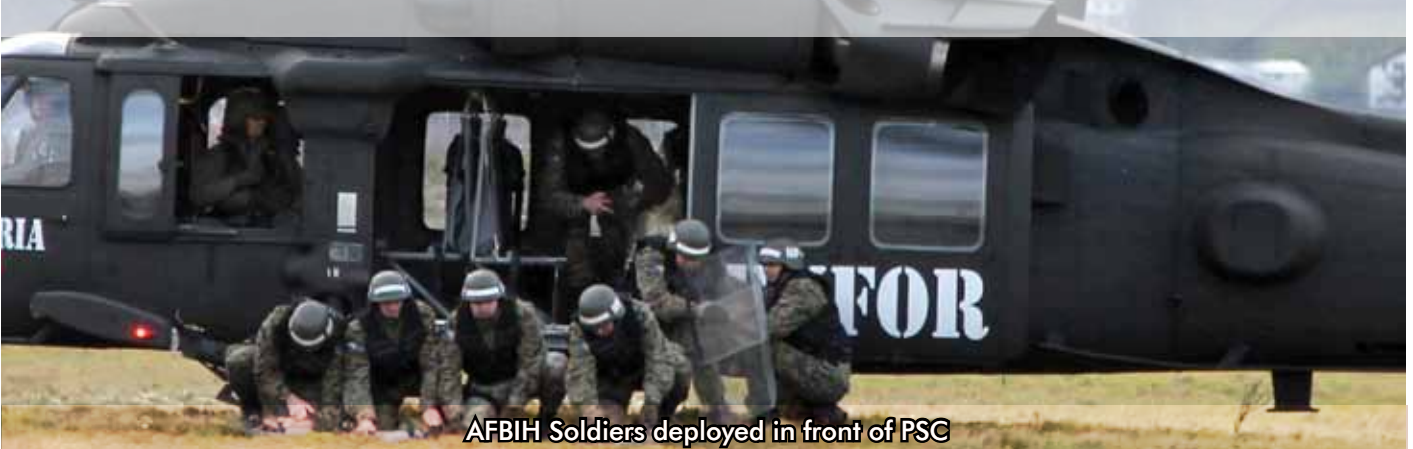
AFBiH Soldiers deployed in front of PSC