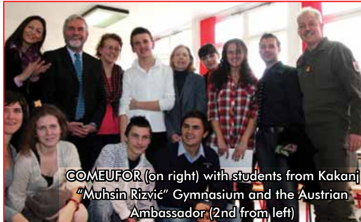
COMEUFOR (on right) with students from Kakanj “Muhsin Rizvić” Gymnasium and the Austrian Ambassador (2nd from left)