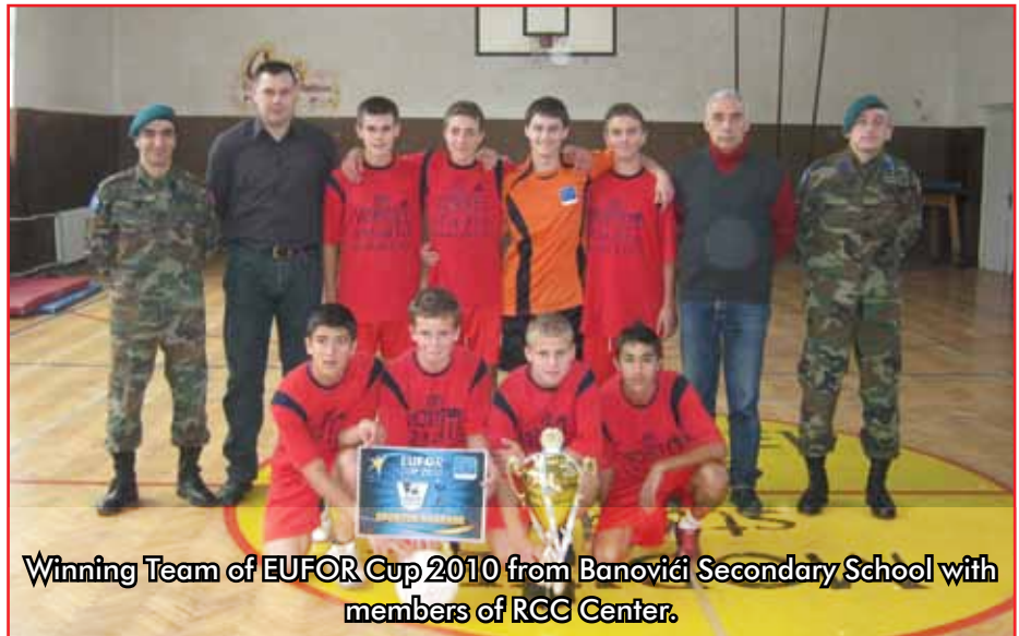
Winning Team of EUFOR Cup 2010 from Banovići Secondary School with members of RCC Center.

He adds the final game was tough, but they succeeded in winning the cup by a last-minute goal. They finished last year's tournament at ninth place, but this year they paid all their attention and concentration on the competition, and, in the end, they were successful.