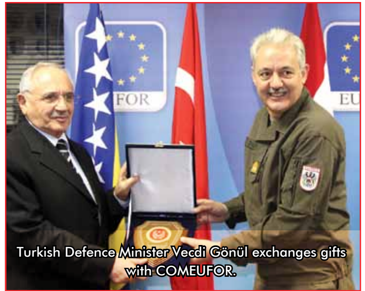
Turkish Defence Minister Vecdi Gönül exchanges gifts with COMEUFOR.