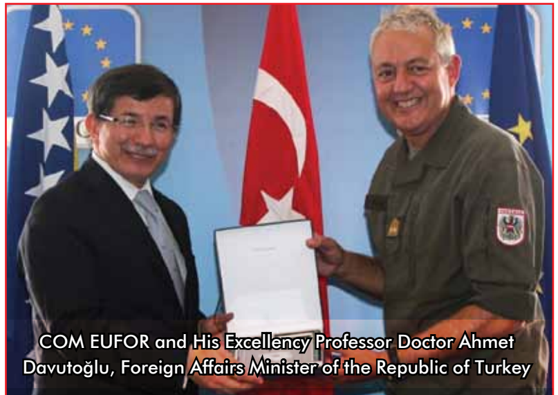
COM EUFOR and His Excellency Professor Doctor Ahmet Davutoğlu, Foreign Affairs Minister of the Republic of Turkey