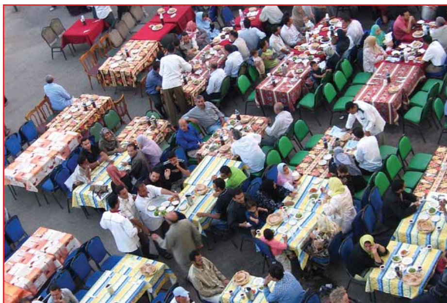
Turkish municipality of Bayrampaşa (in Istanbul) organized an iftar for 2,000 people in Gorazde this year.

“Physical” fasting will not be complete without “inner” spiritual dimension. Muslims read as much of the Qur’an as they can. Some spend part of their day listening to the recitation of the Qur’an in a mosque, meet for Qur’an studies or for con-