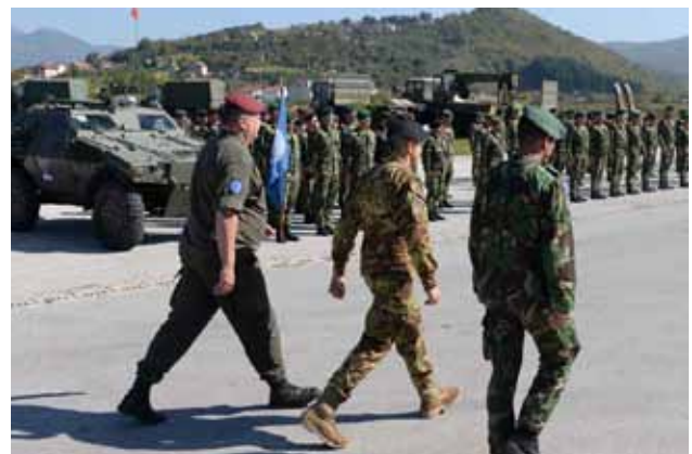
Good pacemakers for their troops. With large steps the two fellow generals inspect KFOR's Tactical Reserve deployed to Sarajevo, BiH, on Oct 1st.

Main issue of their meeting was the joint military exercise “QUICK RESPONSE 2016” near Banja Luka, in which EUFOR troops and European Reserve Forces are training alongside Armed Forces of Bosnia and Herzegovina. Together the multinational troops exercise to support the civilian authorities of BiH in maintaining peace and stability in the region. After inspecting KFOR's rapidly deployed reserve force comprising 240 Portuguese and Hungarian troops, General Fungo headed back for Pristina.