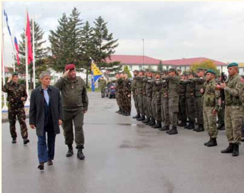
Romanian Prime Minister welcomed by COMEUFOR and honor guard

currently made up of soldiers from 15 EU member states and 5 partner nations. EUFOR's primary roles are to provide capacity building and training support to the Armed Forces of BiH and to support BiH efforts to maintain a safe and secure environment, whilst providing support to the overall EU comprehensive strategy for BiH.