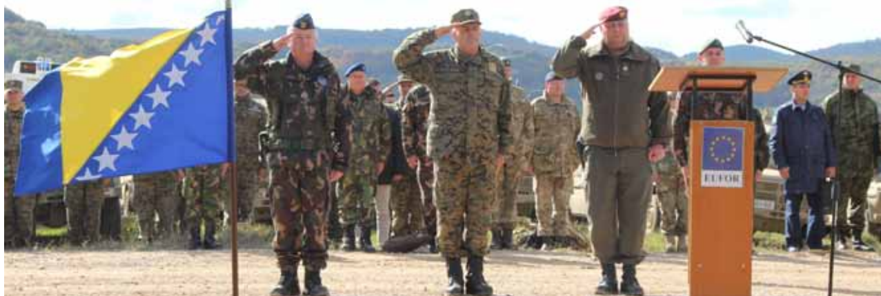
Gen Anto Jeleč, COMEUFOR and COSEUFOR salute their multinational brigade

Commander NATO Sarajevo: “NATO committed to supporting EUFOR to ensure a safe and secure BiH under the Berlin plus agreement”