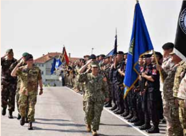
COM KFOR Major General Fungo and the departing convoy from Film City Pristina Kosovo

On 28 Sep 2016 240 troops of the KFOR commenced their road journey to Bosnia and Herzegovina, through Montenegro in order to participate in Exercise “QUICK RESPONSE 2016”. KFOR participated in training with the EUFOR Multinational Battalion and Armed Forces BiH and European Intermediate Reserve Forces.