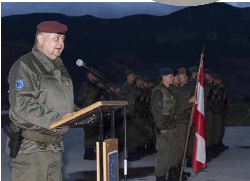
COMEUFOR addressing the troops during military ceremony

The Military Band of the Armed Forces of Bosnia and Herzegovina greatly contributed to the ceremony by playing the impressive Austrian “Grand Tattoo” music composition together with the Military Band from the Austrian Province of Carinthia. In the framework of a military music training cooperation the two military bands form one joint orchestra and perform three concerts in BiH, namely in Sarajevo, Banja Luka and Mostar.