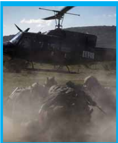
Exercise "QUICK RESPONSE 2016"