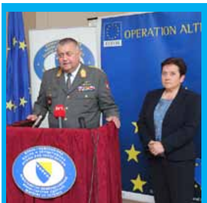
12th Session of the Strategic Committee for Weapons, Ammunition and Explosive Ordnance