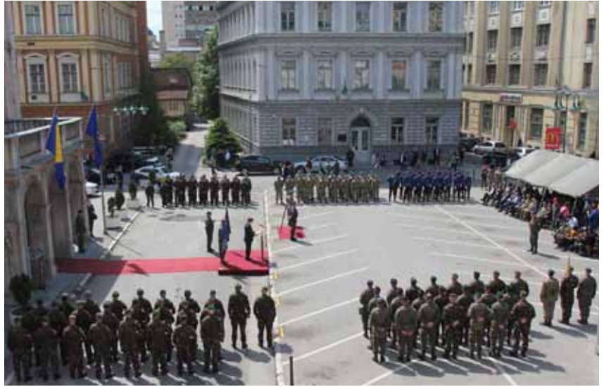
The parade is fully formed for the EUSR’s speech

The event comprised of a ceremony outside Army Hall in Sarajevo, a fly-past by helicopters from EUFOR and the AF BIH, the laying of an EU Wreath and speeches by the EUSR and COMEUFOR; followed by a Reception in the Army Hall. The EUSR said: “EUFOR forms an important part of the EU’s support to BiH”. COMEUFOR stated: “The focus of this event is the EU’s