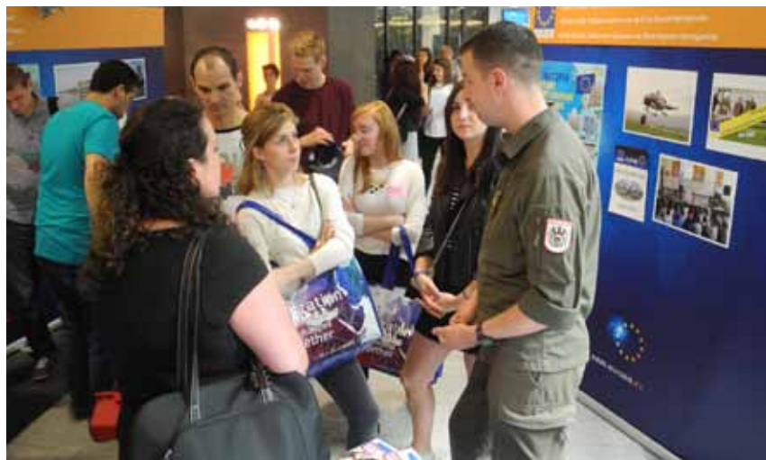
Students from different nations expressed their interest in the EUFOR mission in Bosnia and Herzegovina.