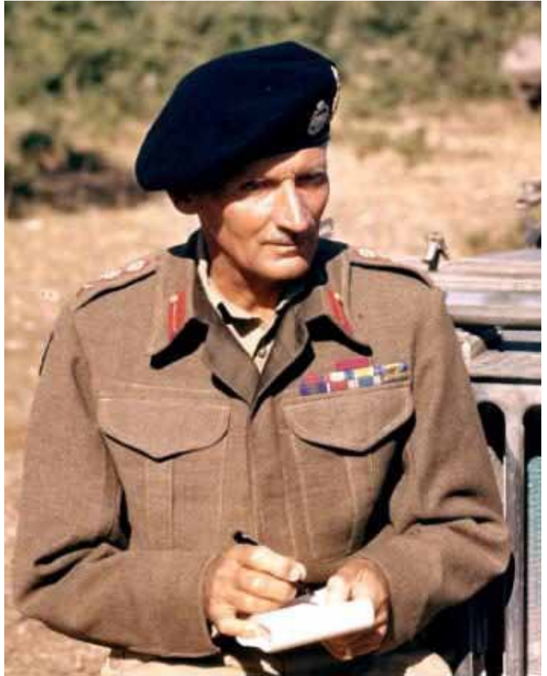
Gen Montgomery and his D-Day battle plan