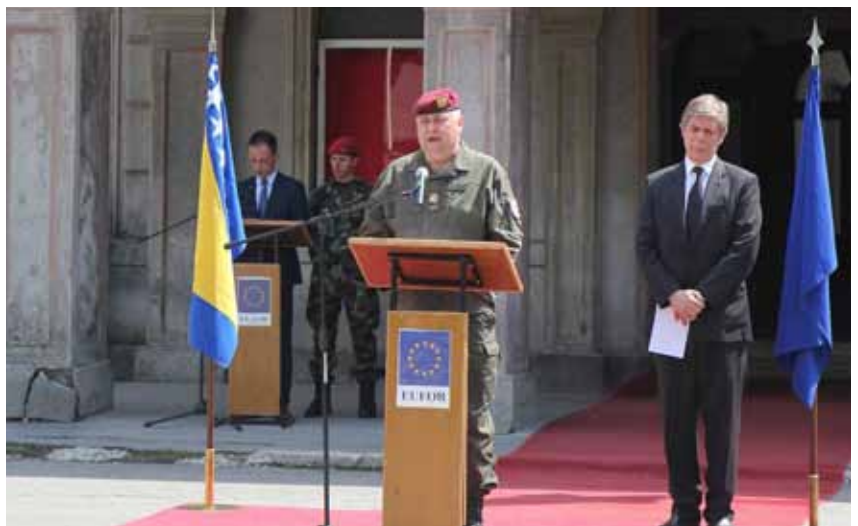
COMEUFOR gives his speech during the parade

Whilst the event took place on EU Day it is also just one of many events that will be conducted in BiH, by the EUSR, over the coming weeks.