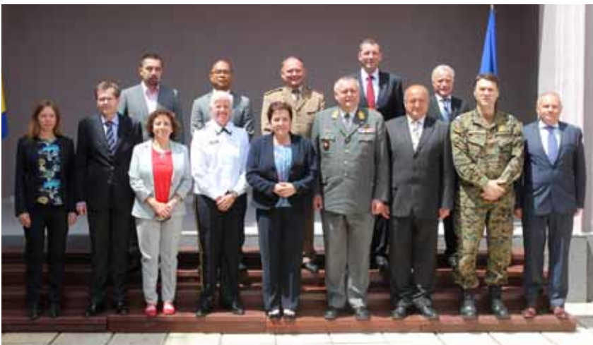
12th Session of the Strategic Committee for Weapons, Ammunition and Explosive Ordnance delegates group photograph.

Project EXPLODE activities include: destroying high hazard ammunition and complex weapon systems; supporting the Armed Forces of BiH in the reduction of military ammunition stockpiles to manageable quantities; conducting training for senior military officers to build their capacities; and implementing