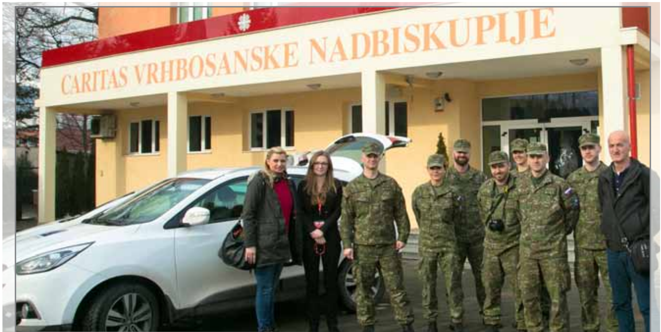
LOT Novo Sarajevo members outside the Caritas building.