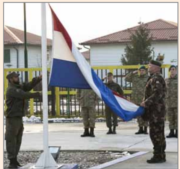
EUFOR MNBN Soldiers Lowering the Flag of the Netherlands for the final time.