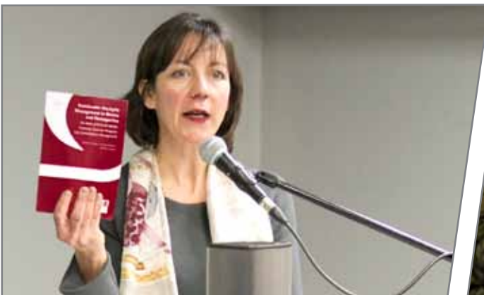
Swiss Ambassador Rauber-Saxer Introducing the Working Paper

Established in 1999, the Small Arms Survey is a global center of excellence whose mandate is to generate impartial, evidence based, and policy-relevant knowledge on all aspects of small arms and armed violence.