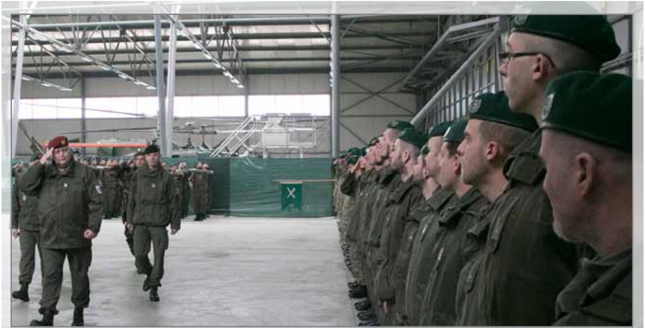
COMEUFOR inspects the MNBN, flanked by the incoming and outgoing Commanders