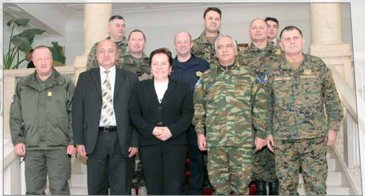
The EUMC Delegation with Minister of Defence Pendeš and MoD Staff