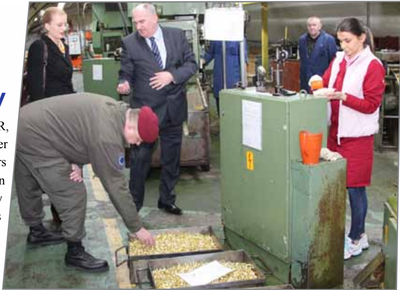
Igman General Director briefs COMEUFOR on the manufacturing process