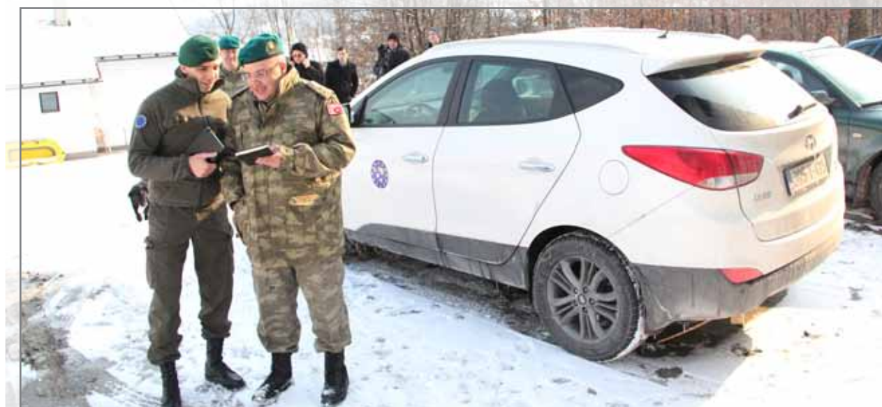
Major Ismet and colleague from EUFOR HQ before departure into town

Turkish military personnel run five LOT houses in total. These are located in Zenica, Jablanica, Livno, Travnik and Zavidovići, which contributes greatly to EUFOR’s LOT house outlay throughout BiH.