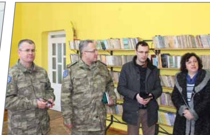
Visit the public library renovated by Turkish LOT