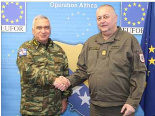
General Kostarakos meets Major General Friedrich Schrötter

The EU Military Committee was established in 2001 and is composed of the Chiefs of Defence of the Member States. It is the highest military body within the Council of Europe and provides advice and recommendations to the Political and Security Committee on all military matters within the EU. During an operation, the EUMC monitors the proper execution of military operations conducted under the responsibility of the Operation Commander.