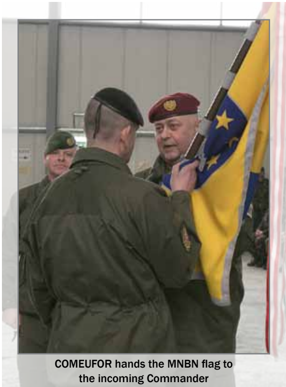
COMEUFOR hands the MNBN flag to the incoming Commander