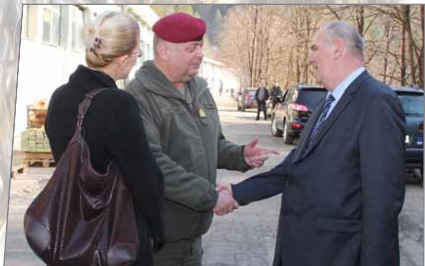
COMEUFOR meets with the Igman General Director

Future development of the Company and the method and results of the inspection itself are key to ensure the company progresses and keeps up in the current market, which will also directly benefit the BiH economy.