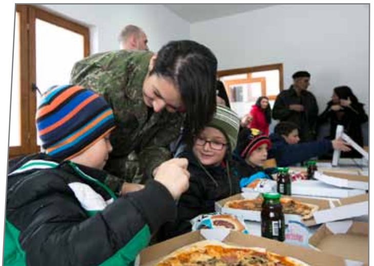
Children from Kamenica receiving their food and gifts.

The primary role of EUFOR’s LOT Houses is to maintain good situational awareness throughout Bosnia and Herzegovina. Seven different countries provide the military personnel to man the 17 LOT houses whose members actively interact with the populace to find out the opinions and needs of the population. Charity events like the above, show that the teams are willing to go above and beyond their required duty in order to make a difference in the community.