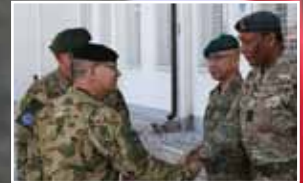
KFOR comes to Camp Butmir