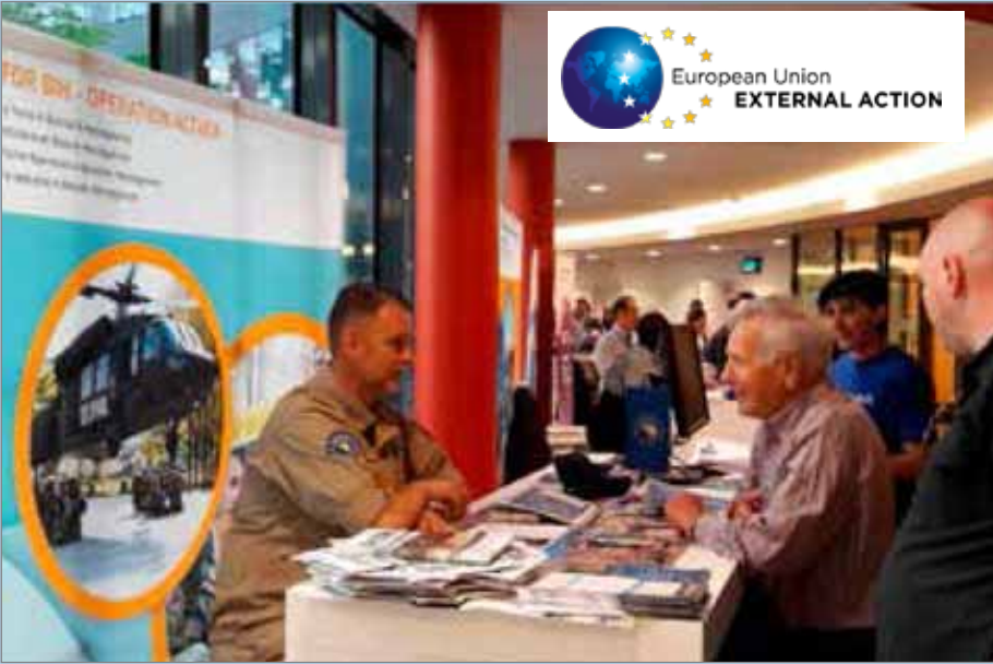
EUFOR BiH – Op Althea personnel discussing their role in ensuring a SASE in Bosnia and Herzegovina and in building the capacity of AFBiH.

Since 2003, the EU has conducted, or is conducting, 34 missions and operations under CSDP. 12 are military operations/missions. The remainder are civilian missions. Currently, the EU is undertaking 16 missions and operations under CSDP (6 military missions and operations and 10 civilian missions).