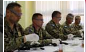
Weapon Storage Management