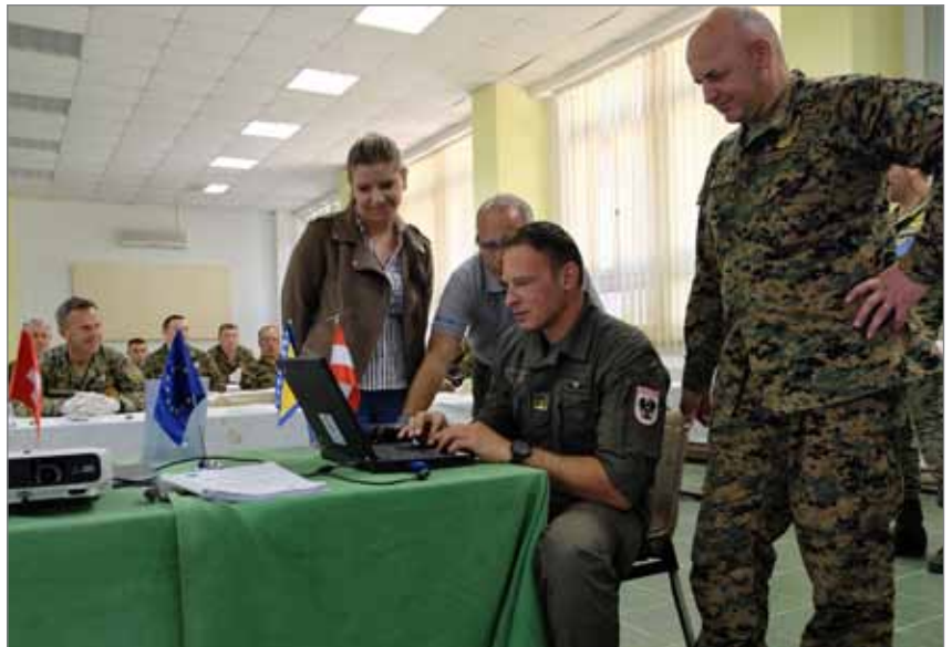
EUFOR MTT in Čapljina

Under EUFOR mentoring, current specialized staff educated newly designated armourers and stockkeepers to enable AFBiH to store small arms and light weapons according to international standards as a precondition to ensure