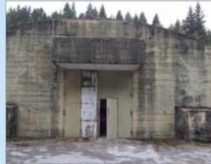
This building looks to be in reasonable condition from the front...