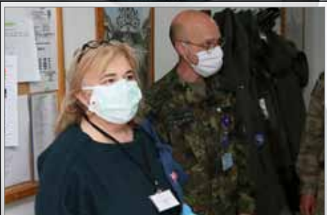
Sarajevo epidemiologists visit Camp Butmir Page 9