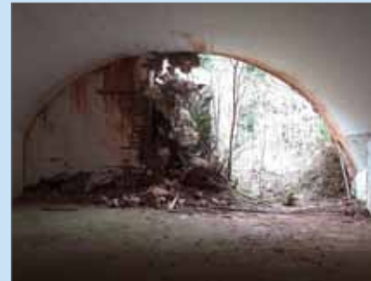
...however, inside the picture tells a different story.