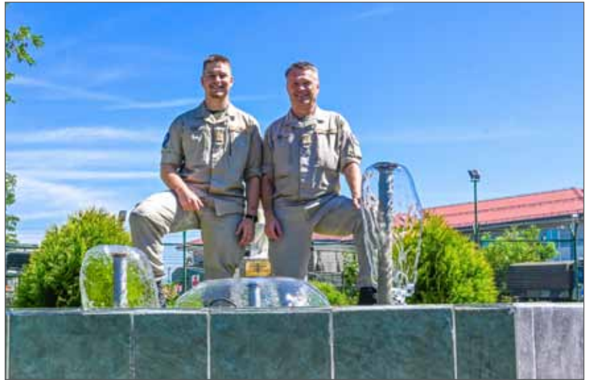
Park in Camp Butmir