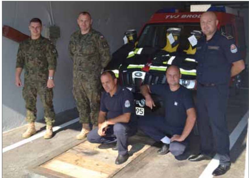
LCC Donations to the Doboj Fire Brigade

personnel continued to liaise with the relevant local authorities on important issues in the area of operations, migration included. The COVID-19 pandemic and the subsequent restrictions disrupted the normal activity of the population in the area. Although significant, the above mentioned challenges did not have a negative impact on Safe and Secure Environment.