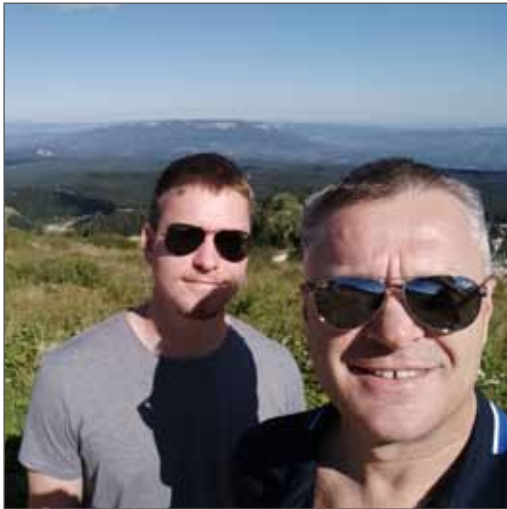
A Trip to up to Jahorina

every operation has its own special charm and individual character depending on the commander, the situation and your comrades. It was a very similar situation at the time. Just like now, after discussing it, my son gladly accepted my proposal to deploy to Bosnia with my unit as a driver for 6 months, bridging the gap between School and University. Uniquely, at that time (2015) there were three fathers deployed to EUFOR with their sons.