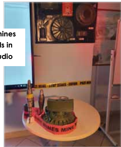
MRE mines models in the studio