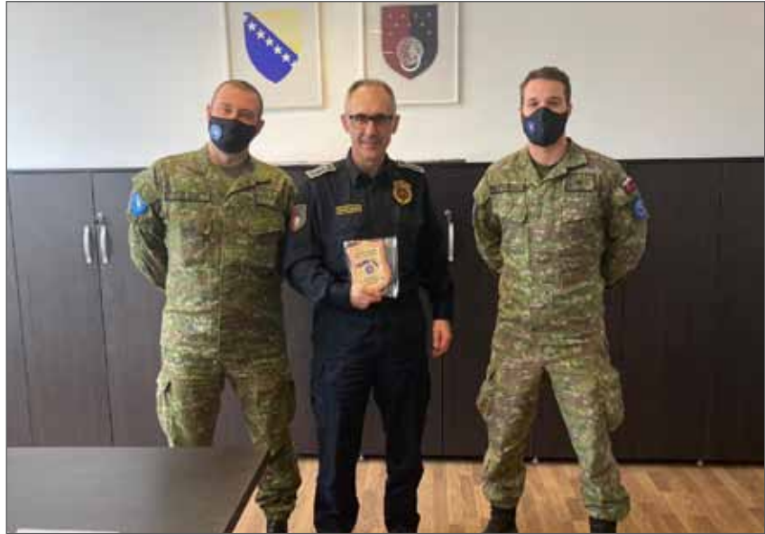
LOT Team members meeting with Sarajevo police counterparts

The year 2020 was particularly challenging in the LOT Cazin area of operation where EUFOR