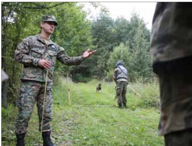
EUFOR personnel working in close cooperation with the Armed Forces of Bosnia and Herzegovina.

In order to achieve our objectives JMA collaborates with an array of stakeholders, such as the BiH authorities, the AFBiH and demining NGOs. When our competencies overlap, JMA coordinates and cooperates with Special Ammunition and Weapons Advisor (SAWAD), which is responsible for the destruction of Small Arms and Weapons.