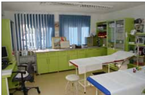
Stolac Health Care Center

Funds raised by Turkey have been used to improve the capacity of two Bosnian Health Care Centers. The Health Care Center in Stolac has been renovated and two Dialysis Machines