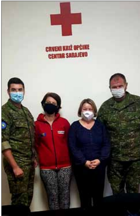
Meeting with the Sarajevo Red Cross